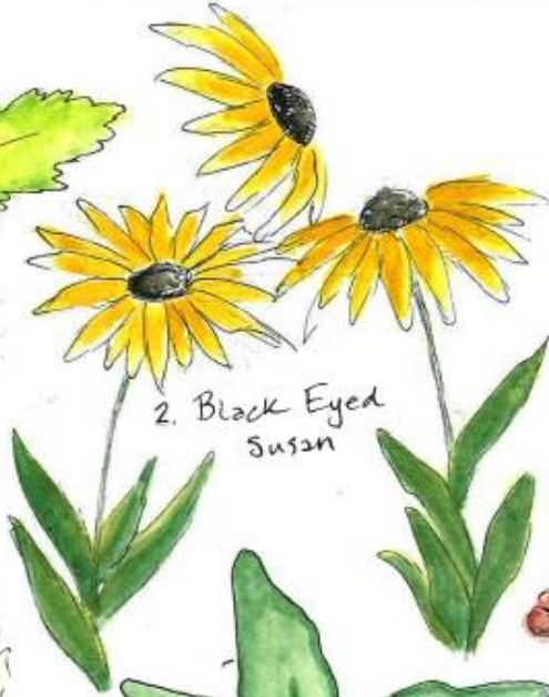
2. Black Eyed Susan