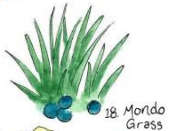
18. Mondo Grass