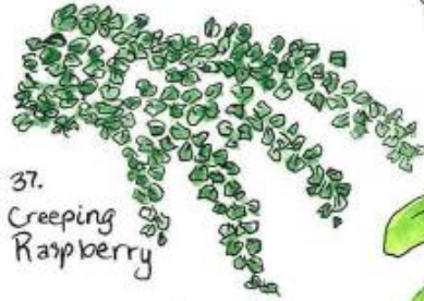
37. Creeping Raspberry