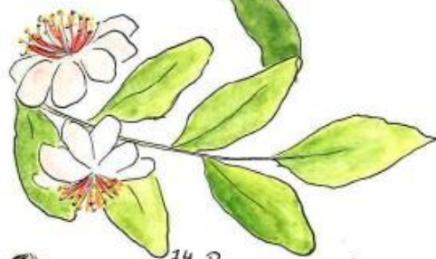
14. Pineapple Guava