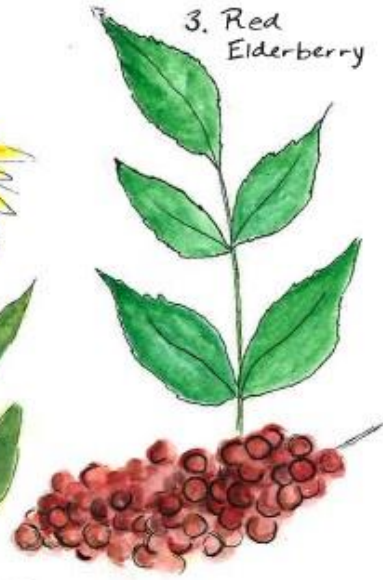
3. Red Elderberry