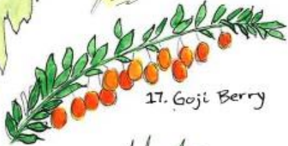
17. Goji Berry