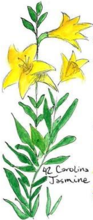
42. Carolina Jasmine