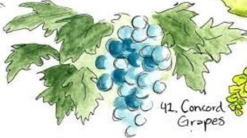
41. Concord Grapes