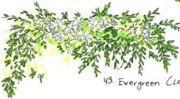
43. Evergreen Clematis