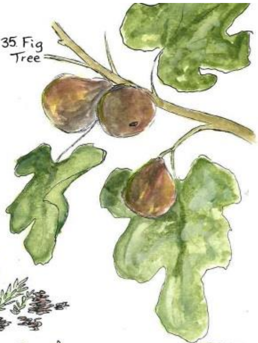
35. Fig Tree